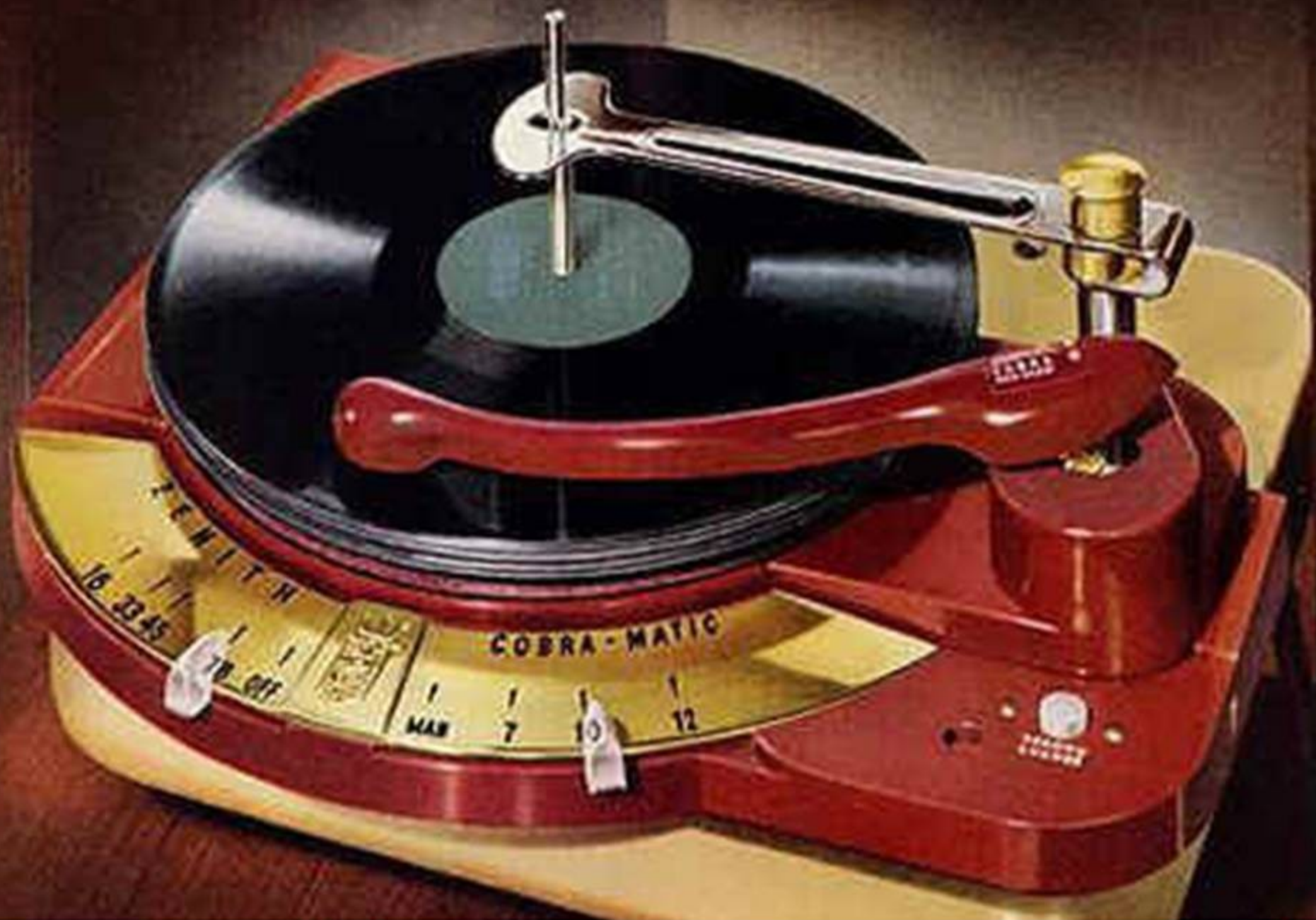
Zenith Cobra-Matic Record Changer 1950