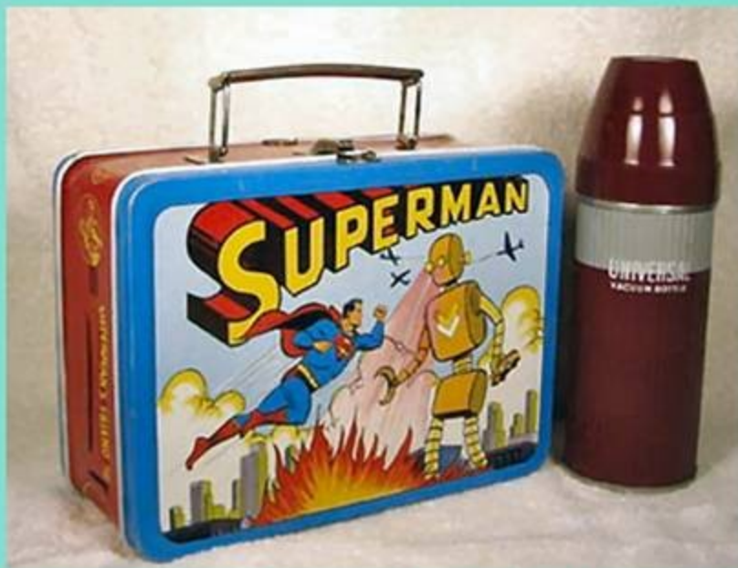
Superman Lunchbox 1954