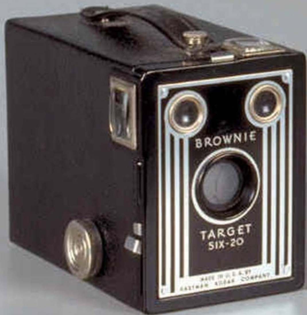
Brownie Target Six-20 Camera 1946