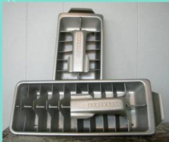
Metal Ice Cube Trays 1958