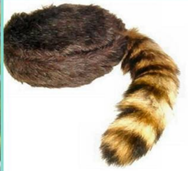
Davy Crockett Coonskin Cap 1955