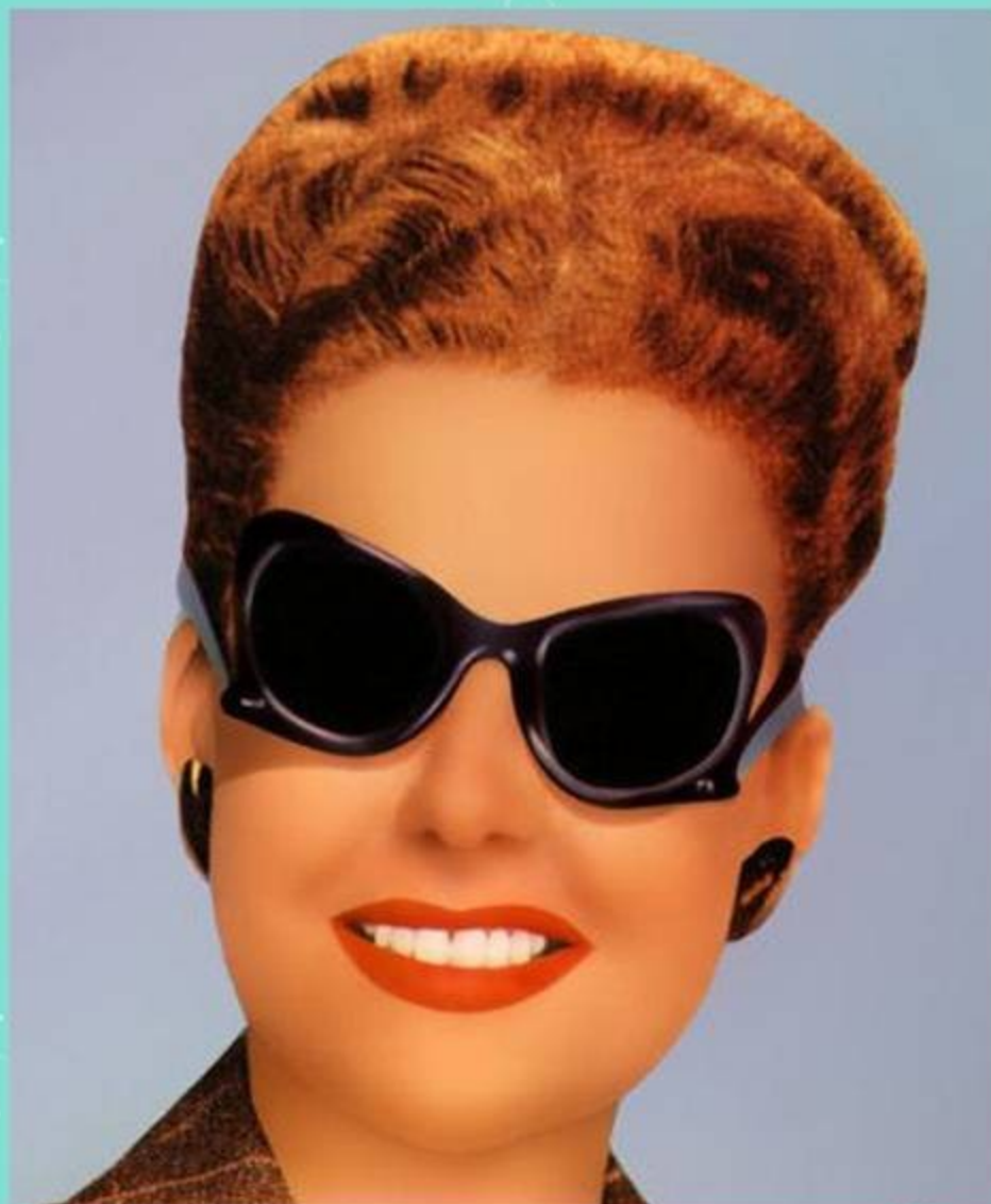
Solarex Scientific Sun Glasses 1948