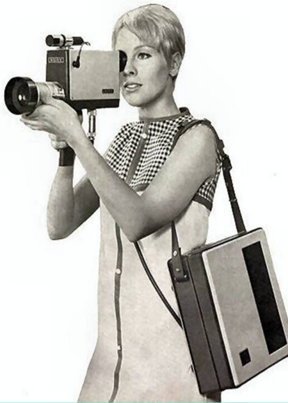
Sony Video Rover DV-2400 Portapack 1967