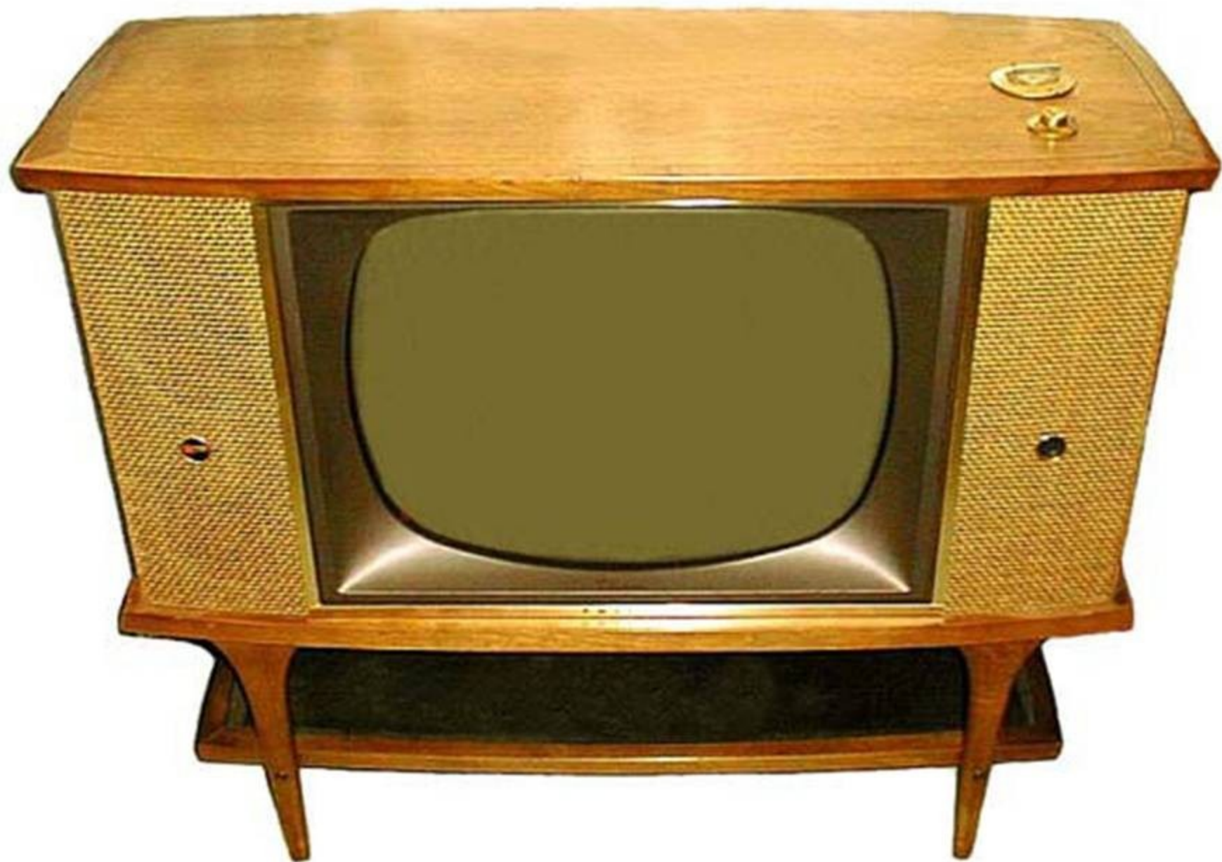
Philco Predicta UG-4744 1960