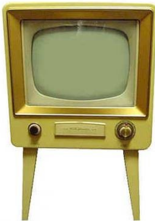
RCA 17S351 1954