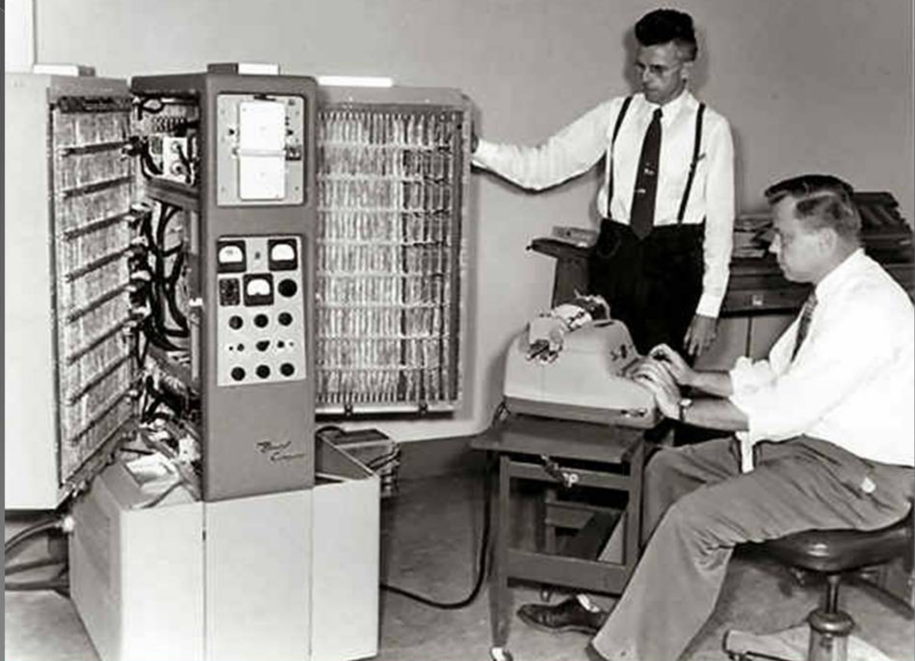
Bendix G-15 Computer 1956