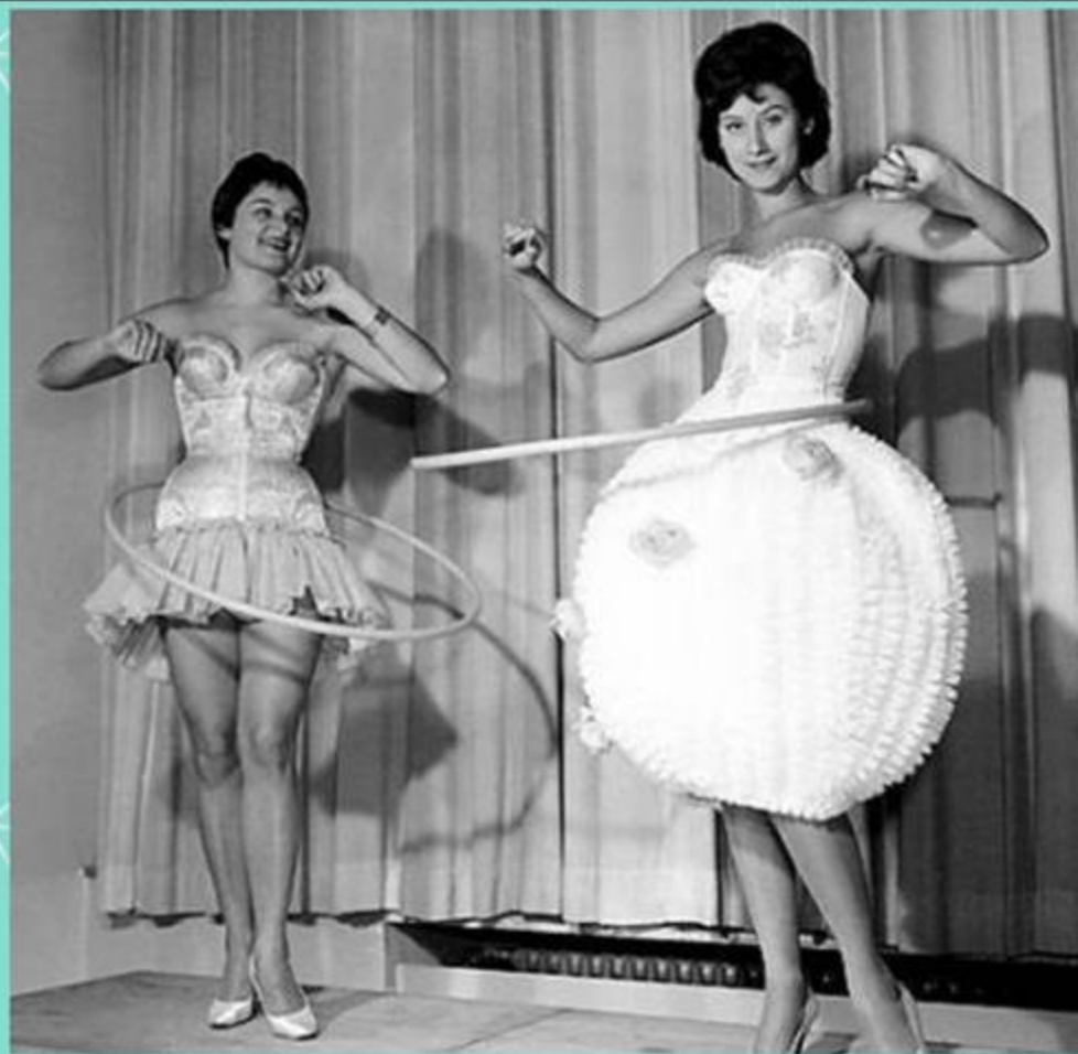
Hula Hoops 1959