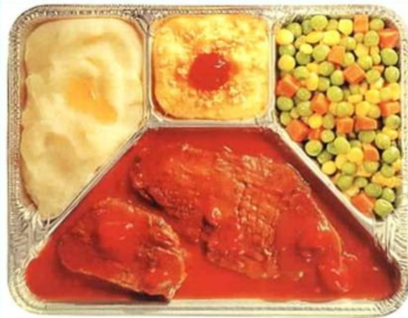
Swanson TV Dinner 1959