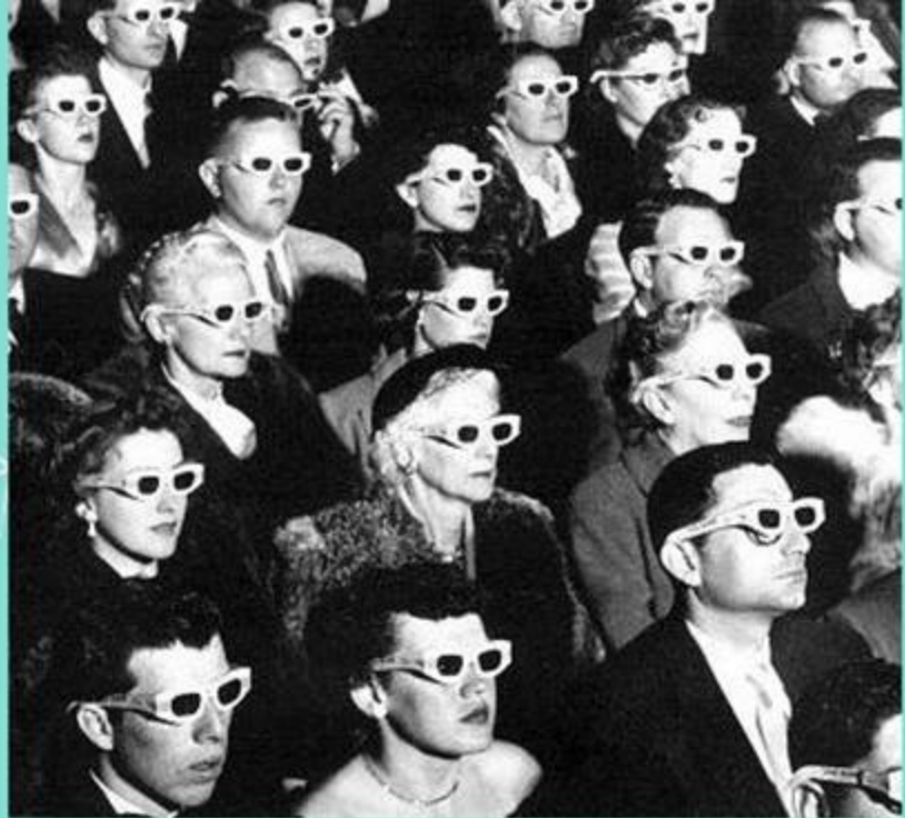
3-D Glasses 1956