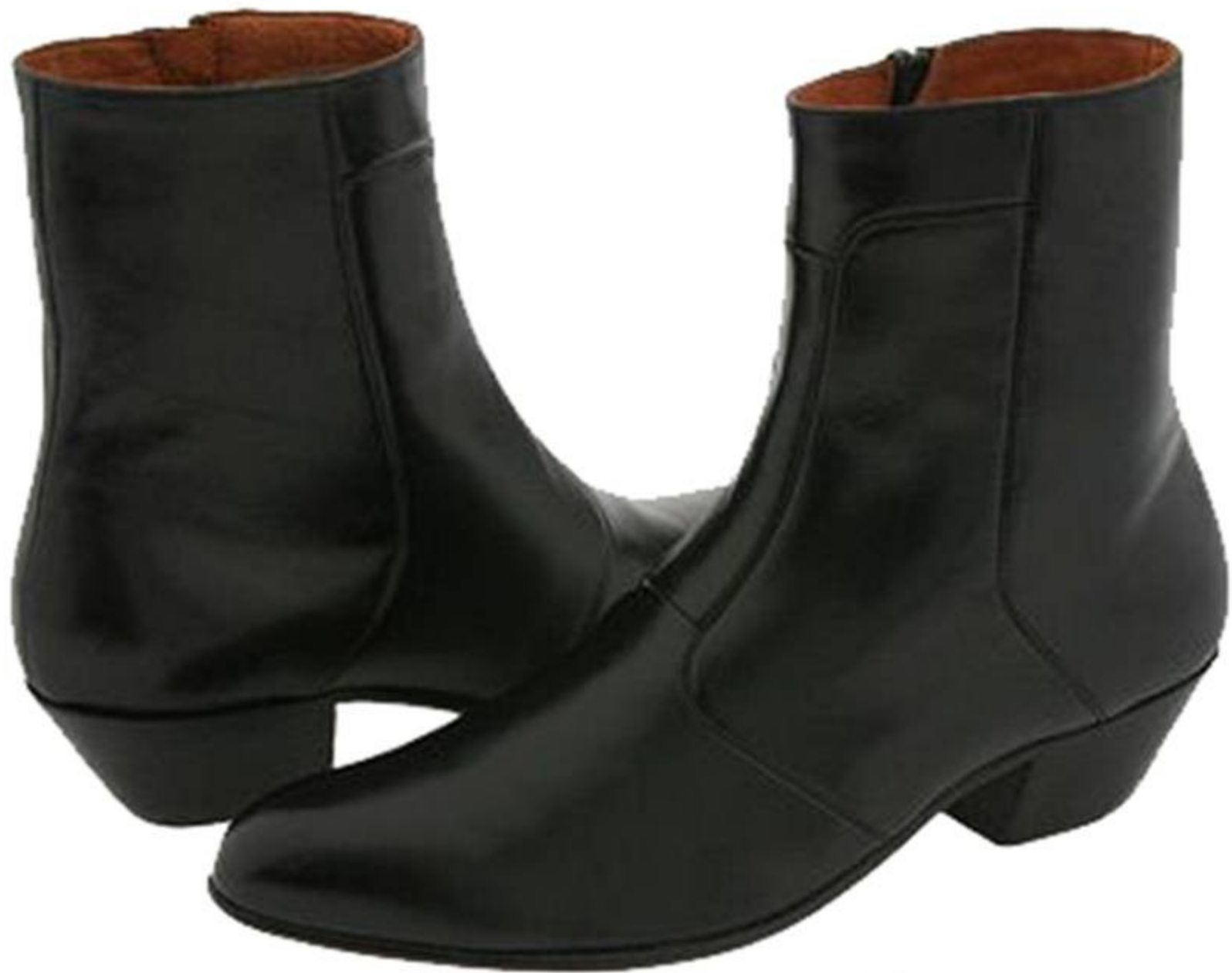
Beatle Boots 1964