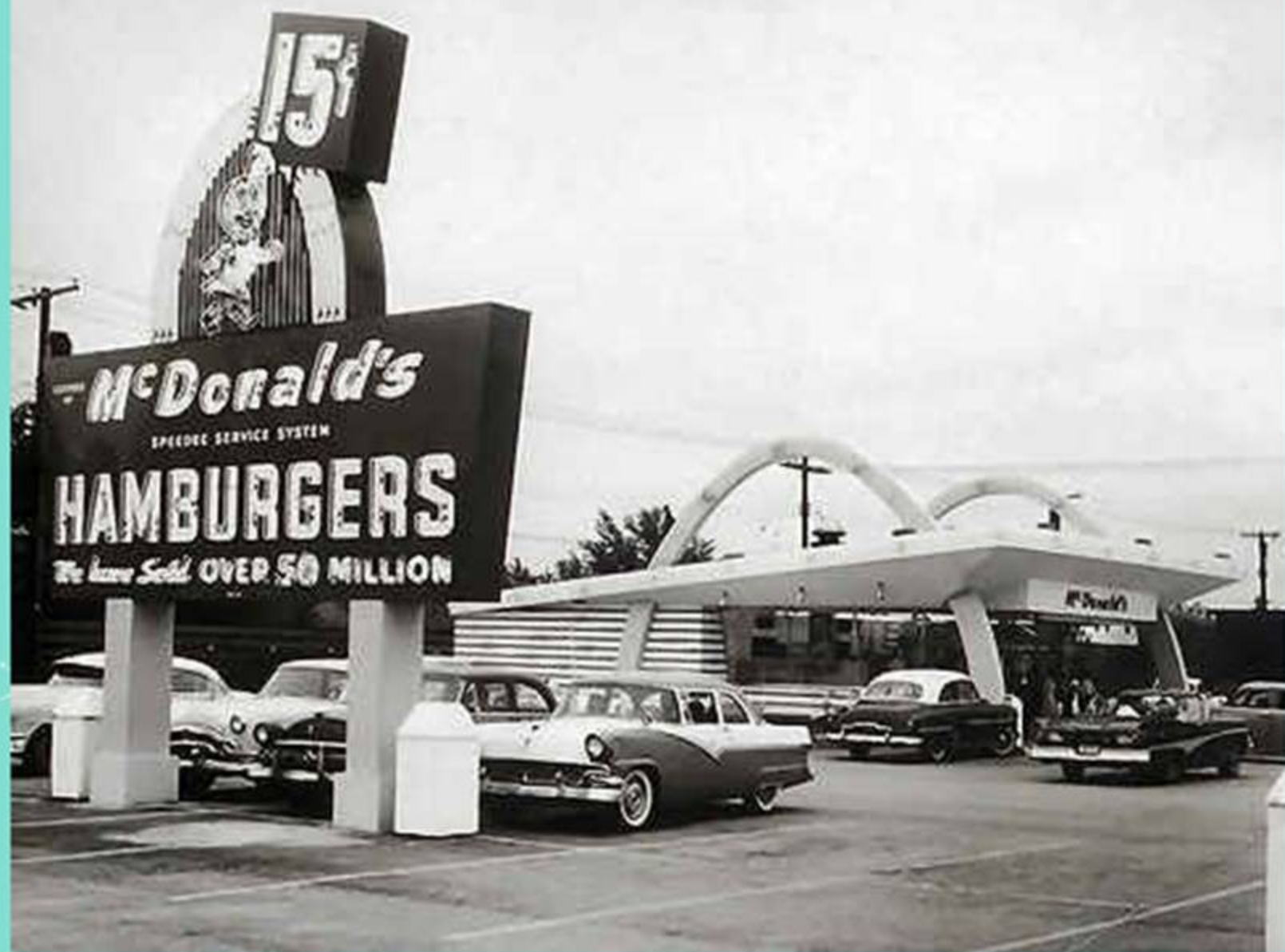
First McDonald's 1955