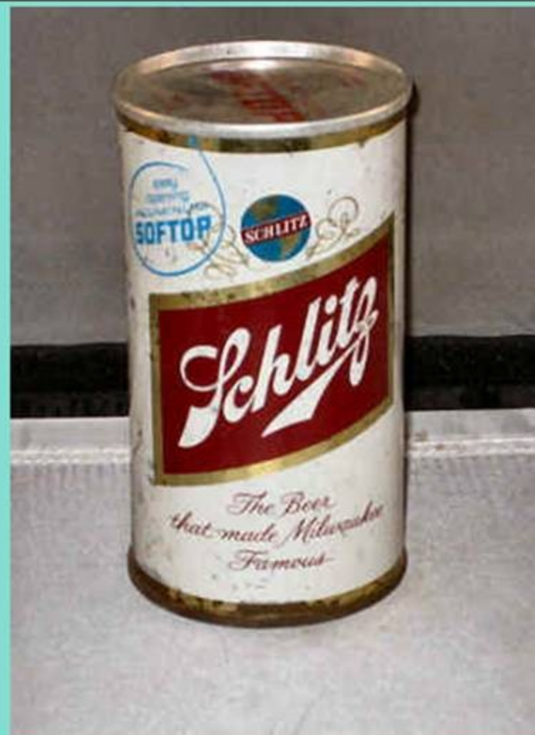
Schlitz Softop Can 1960