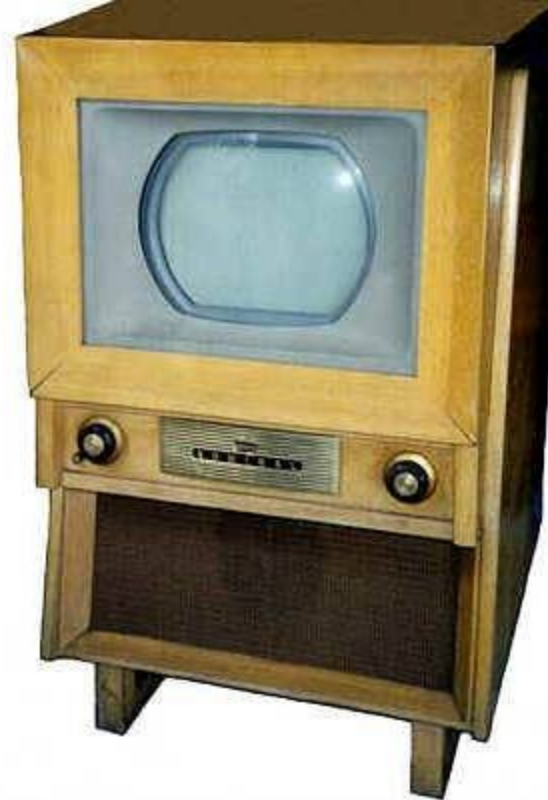
Admiral Color C1617A 1953