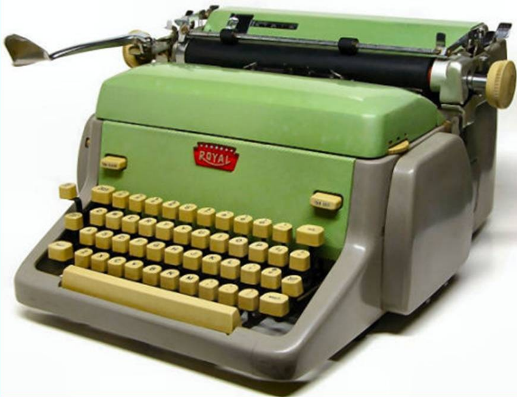
Royal Typewriter Model FP 1961