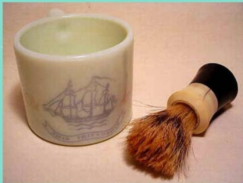
Old Spice Shaving Mug 1951