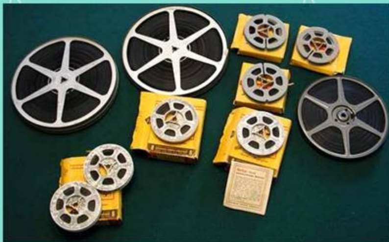
8mm Movie Film 1960