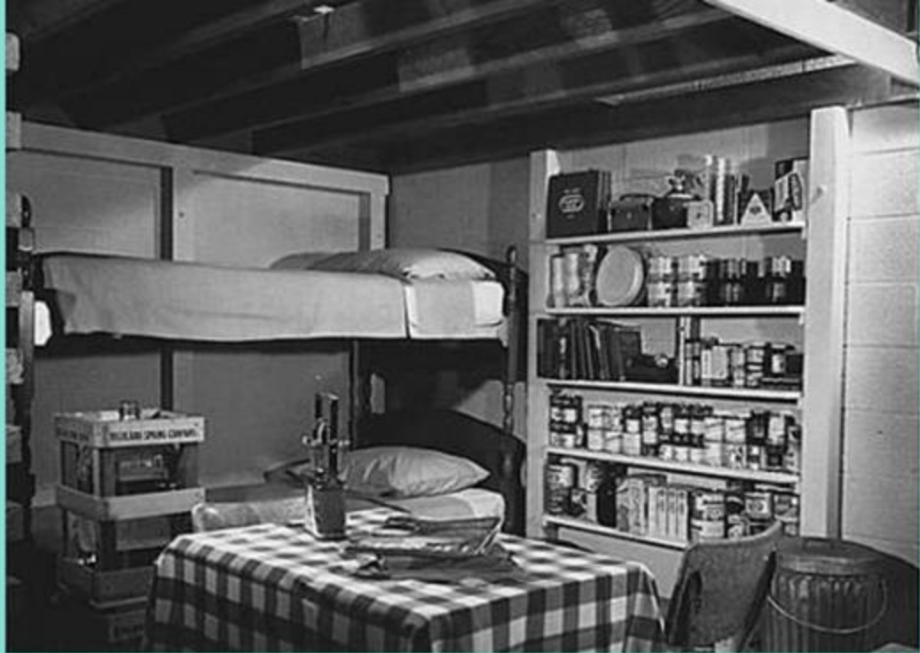
Fallout Shelter 1957