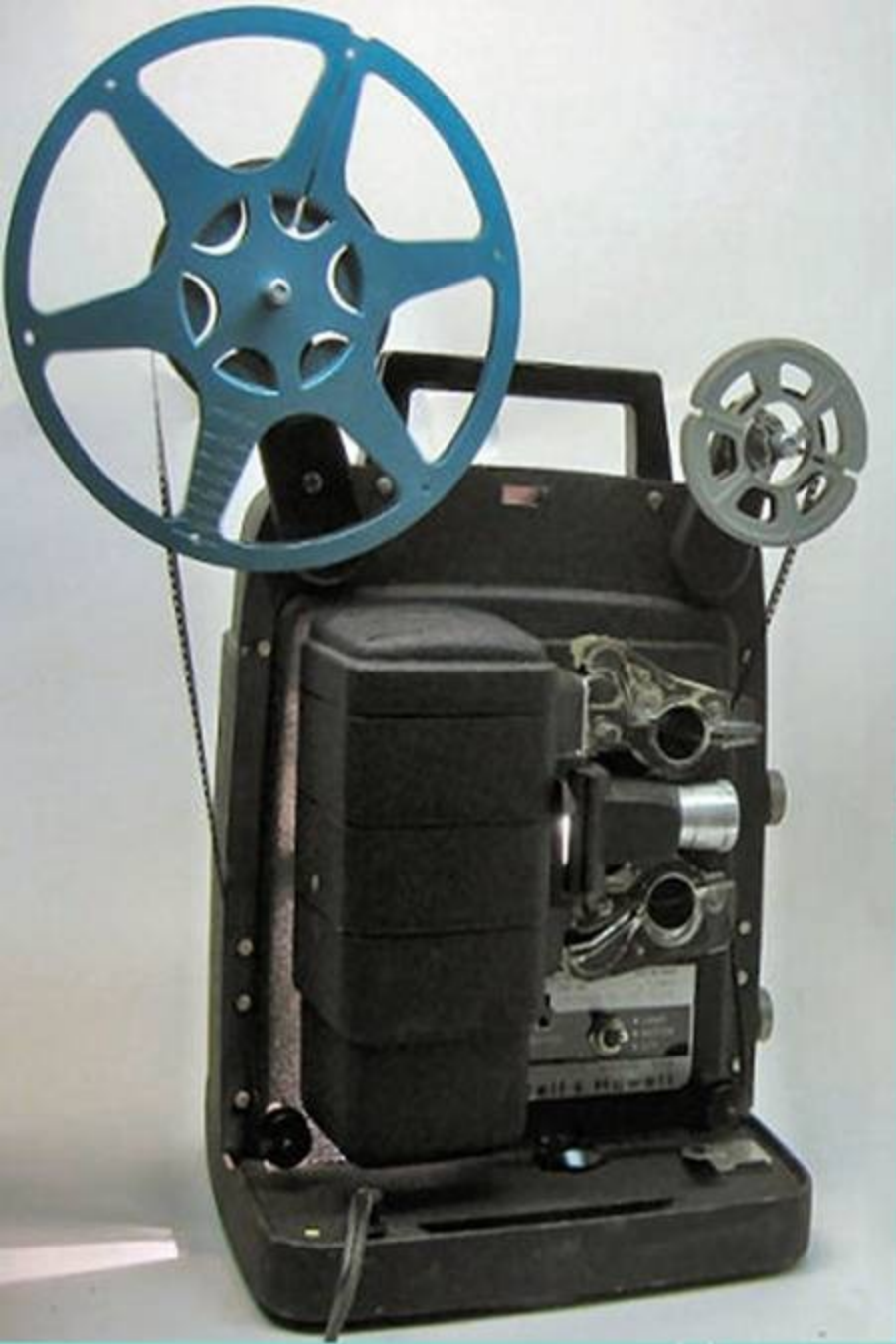
Bell & Howell 256 8mm Projector 1963