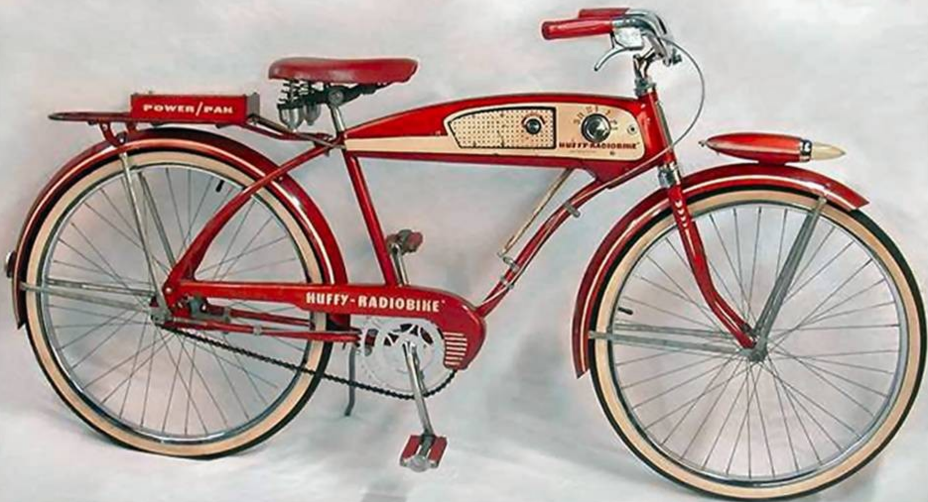
Huffy Radiobike 1955