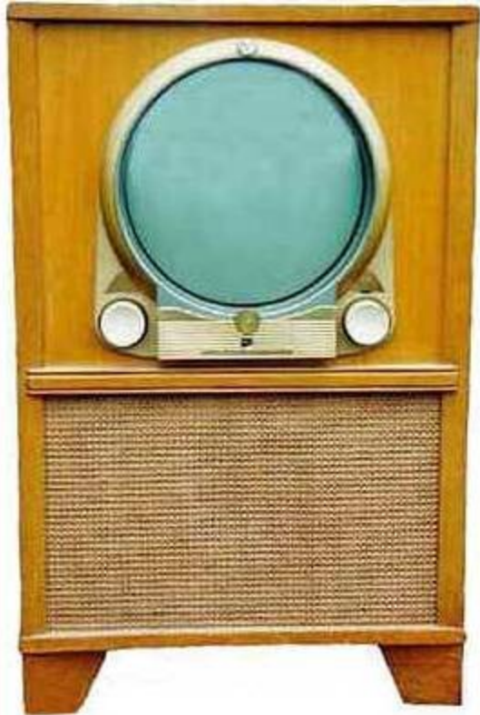
Zenith G2355 1950