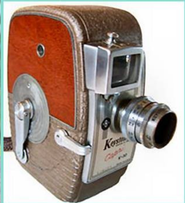
Keystone Capri K-30 8mm 1957