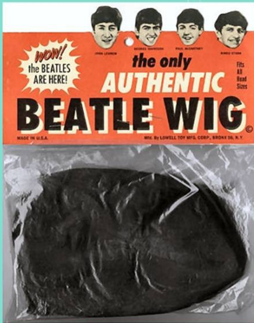
Beatle Wig 1964